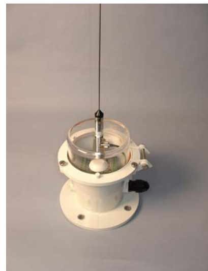
ATONIS AIS Transponder

Our ATONIS AIS transponder is specifically designed with the very low power consumption required by buoy power systems. It operates off 12 Volts DC and consumes less than 1 amp-hour per day making emergency battery back-up and solar powering the preferred configuration. It can be packaged for NEC Class 1 Division 2 Hazardous Areas or IEC Zone 1 areas