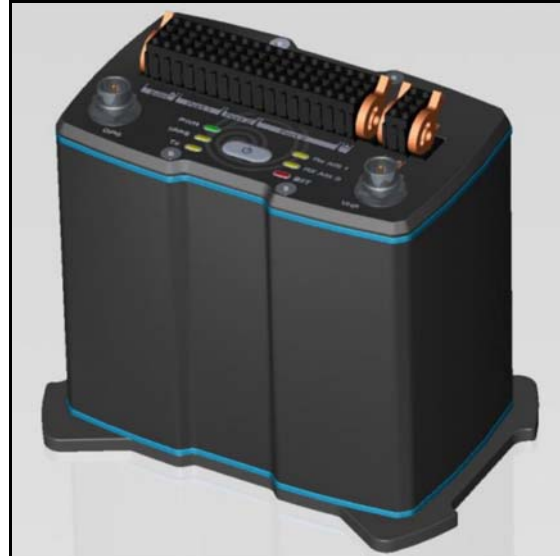
ATONIS PRO Transponder

Specifications subject to change without notice Form No.:042511A