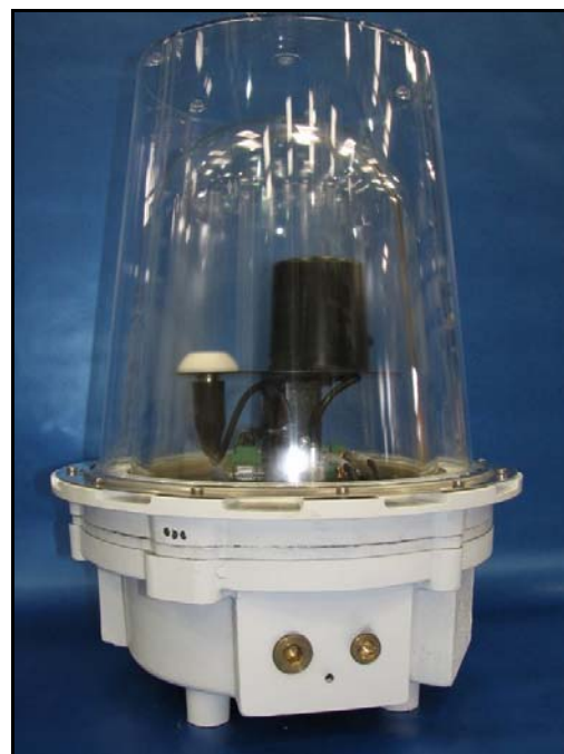
ATONIS PRO Transponder fitted in ATEX Certified Ex 'd' Zone 1 Enclosure

The modular design of ATONIS PRO makes it possible to have a low-cost platform for less complex applications but a system that is scalable to permit use in the most complex applications by adding hardware modules. This means the AtoN Authority does not pay for unused components. And it allows for repair of a unit by replacing the faulty component board rather than the whole unit.