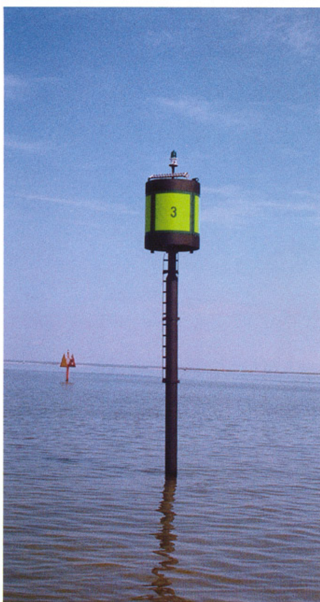
Port of Houston Ship Channel