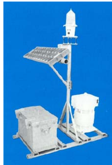
WITH SA850/1A SOUND SIGNAL