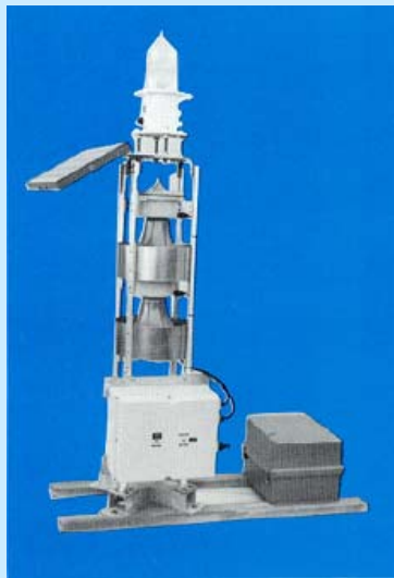
WITH DA-2 SOUND SIGNAL

Automatic Power offers two Class B Single Lift Assemblies. Each is compact and rugged one with the DA-2 half mile sound signal and one with the SA 85011A half mile sound signal. Each one meets or exceeds U.S. Coast Guard requirements for Mass B Aids to Navigation as specified in 33 FR Sub-part 67. Each self contained unit includes a solar power system with batteries and battery box. The solar array can be positioned in the field to assure it faces due south,